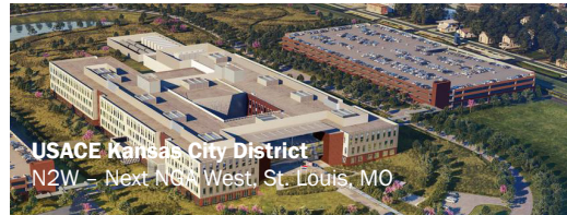
USACE Kansas City District N2W - Next Move West, St. Louis, MO