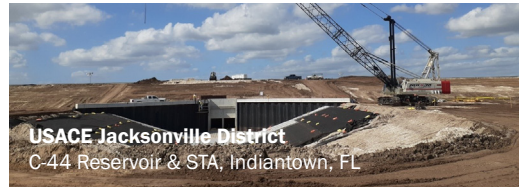
USACE Jacksonville District C-44 Reservoir & STA, Indiantown, FL

Crawford has supported more than $2B worth of construction with USACE New York District providing construction management services at historic West Point, Joint Base McGuire-Dix-Lakehurst, Watervliet Arsenal, and Fort Drum.